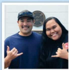
Les Shiroma $100 Gift Card for Hawaiian Airlines